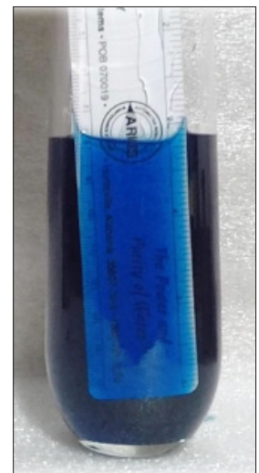
DIW 317-875 AFTER >20,000 CYCLES