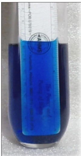
NEW, UNUSED OIL