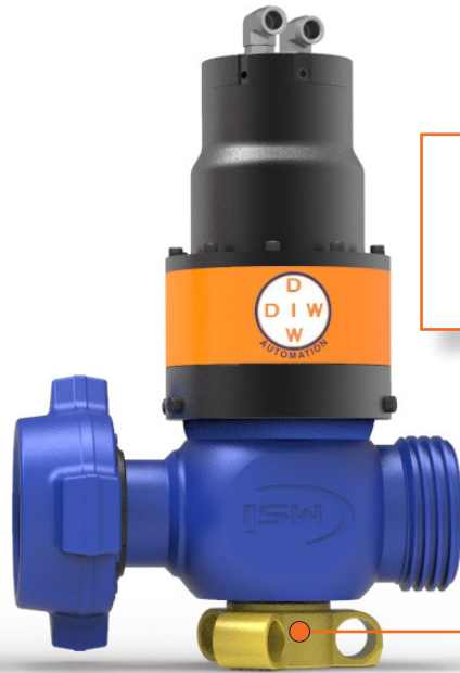
MSI 316 VALVE, 2X2"1502 (HYD ACTUATED 317-875) TOTAL WEIGHT: 90 LBS

HYDRAULIC SYSTEM FAILURE? SECONDARY MEANS OF ACTUATION NO DISASSEMBLY REQUIRED