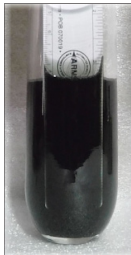
BRAND X ACTUATOR AFTER <10,000 CYCLES